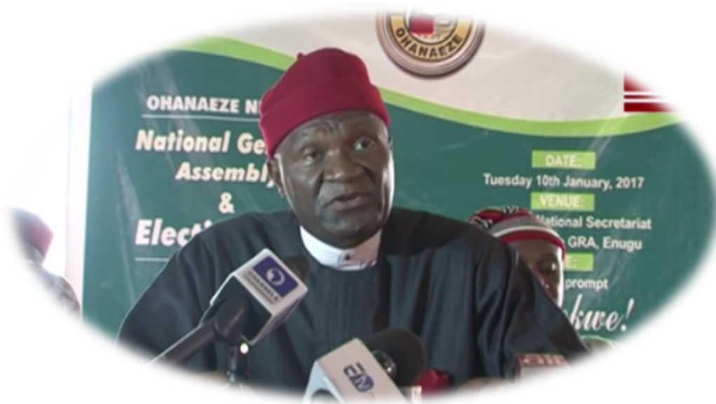
Chief Barr. John Nnia Nwodo