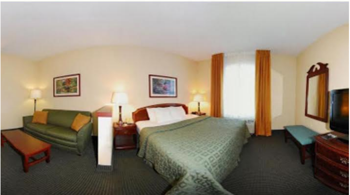
Comfort Inn [6]